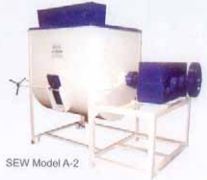
SEW Model A-2