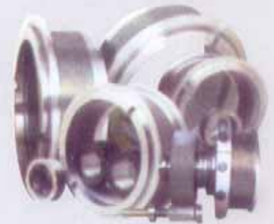
DIES & ROLLS